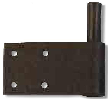
20-252 Jam Pintle Plate 2-1/2" x 4-3/4" - 1/4" Thick Right and Left Hand Available